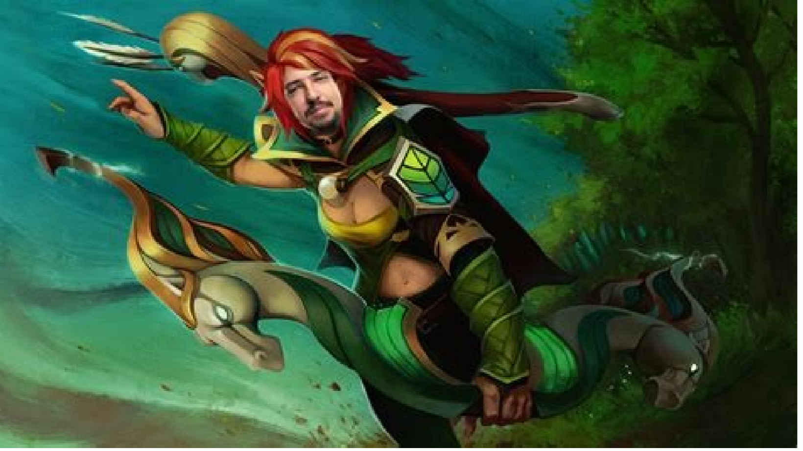
Dota 2 invoker build. Dota 2 invoker guide.