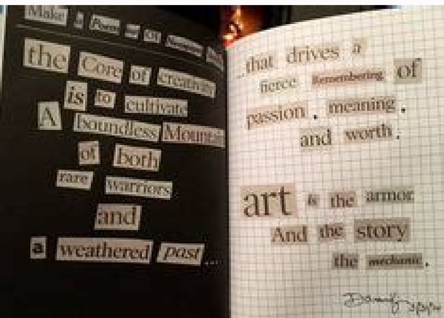
Steal like an artist journal free pdf. The best artists steal quote. What is steal like an artist about. Who said good artists borrow great artists steal.